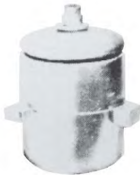
Top opening design. Cast aluminum body, rubber disc. 4" has 2 Lugs.