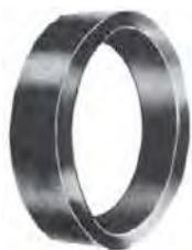
Chevron type. Highest quality rubber.

For top opening hydrant valves. With lever lock. Fits 4" lug valve.